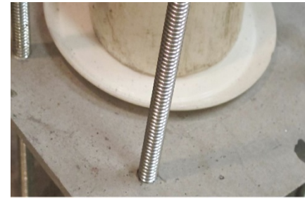
Gasket Seals the Pipe

Get that gasket material in place: Next, raise the upper plate using the battery-powered drill motor to turn the all-thread clockwise until the gasket material is pressed against the pipe opening, sealing it.