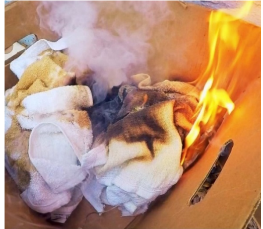
Class A Fire

Which isn't hard. Now imagine distant sirens getting closer. Not because of too much oxygen or because of explosive gas. (You sorted those out with your meter readings.) No, those sirens are hustling to the site of smoke, and where there's smoke, there's fire. And that's the third disaster awaiting the unwary: Burnable stuff.