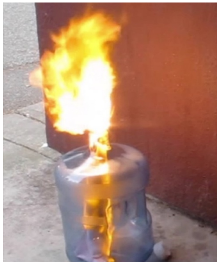
Cotton burning in 100% Oxygen

First, you're imagining a good friend in the aid car, skin in shreds because his clothes burnt with incandescent fury in a tank thick with leaked oxygen. Today your friend will be safe because your meter test confirms the workplace air has stayed at 21% O 2 .