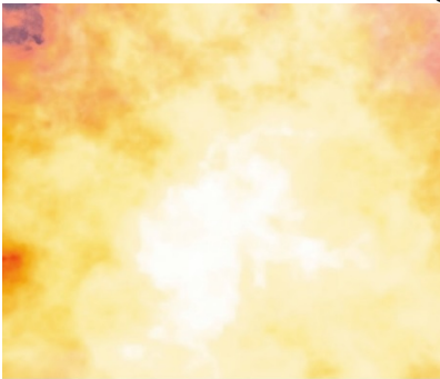
Gas Tank Explodes

And remember; in the contained and reflected heat of compartments below-deck, EVERYTHING burns! So, armed with a bright flashlight and enthusiasm, you make a thorough inspection to get rid of stuff which might catch fire if sparks were to land on it.